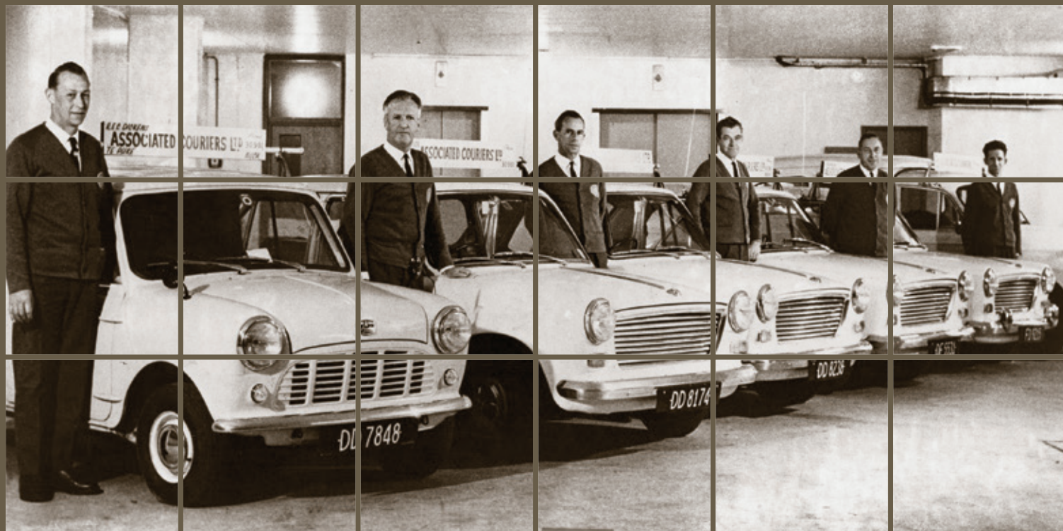
As pioneers of New Zealand's express package industry, we trace our origins back to 1964.