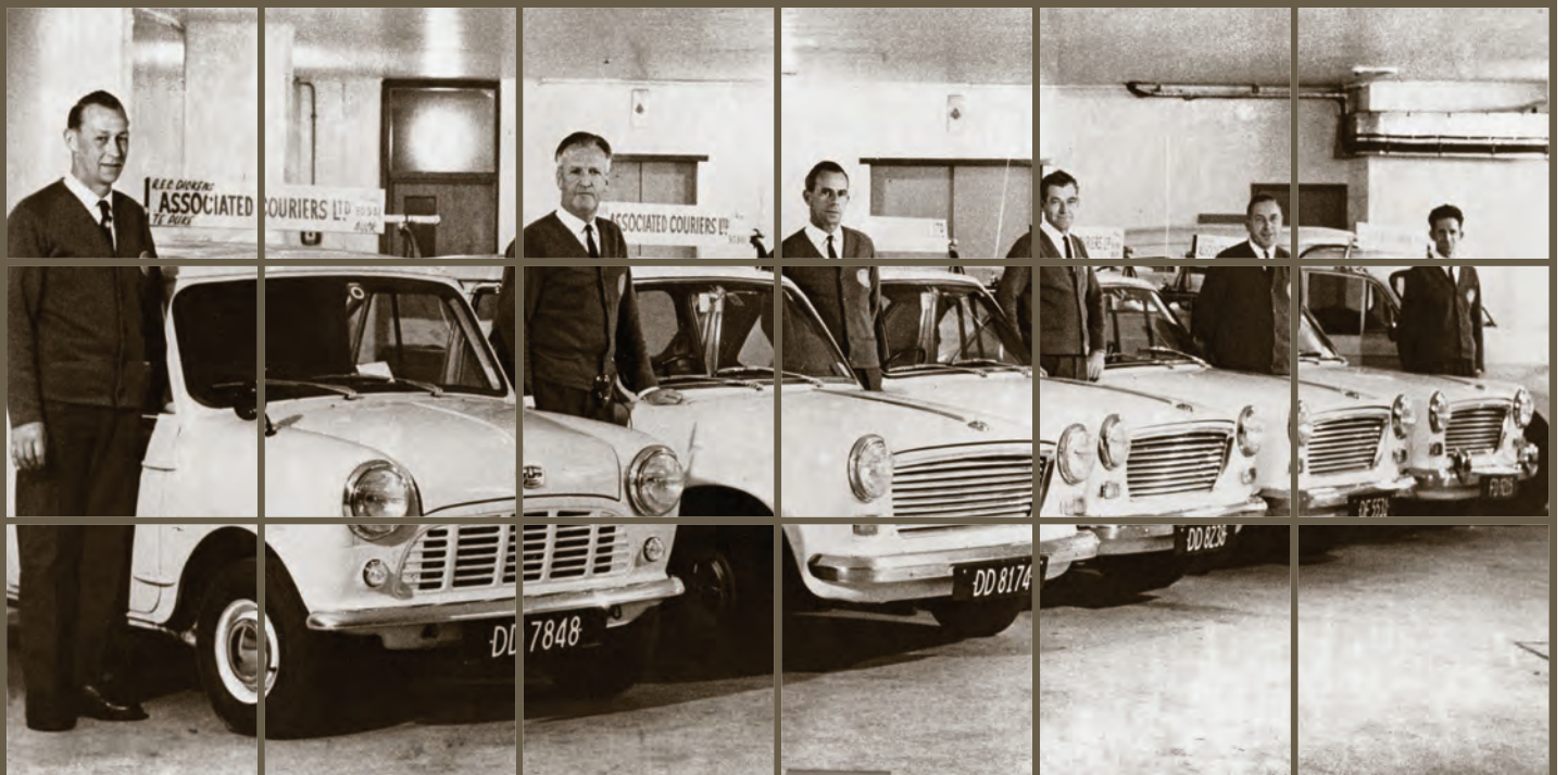
As pioneers of New Zealand's express package industry, we trace our origins back to 1964.